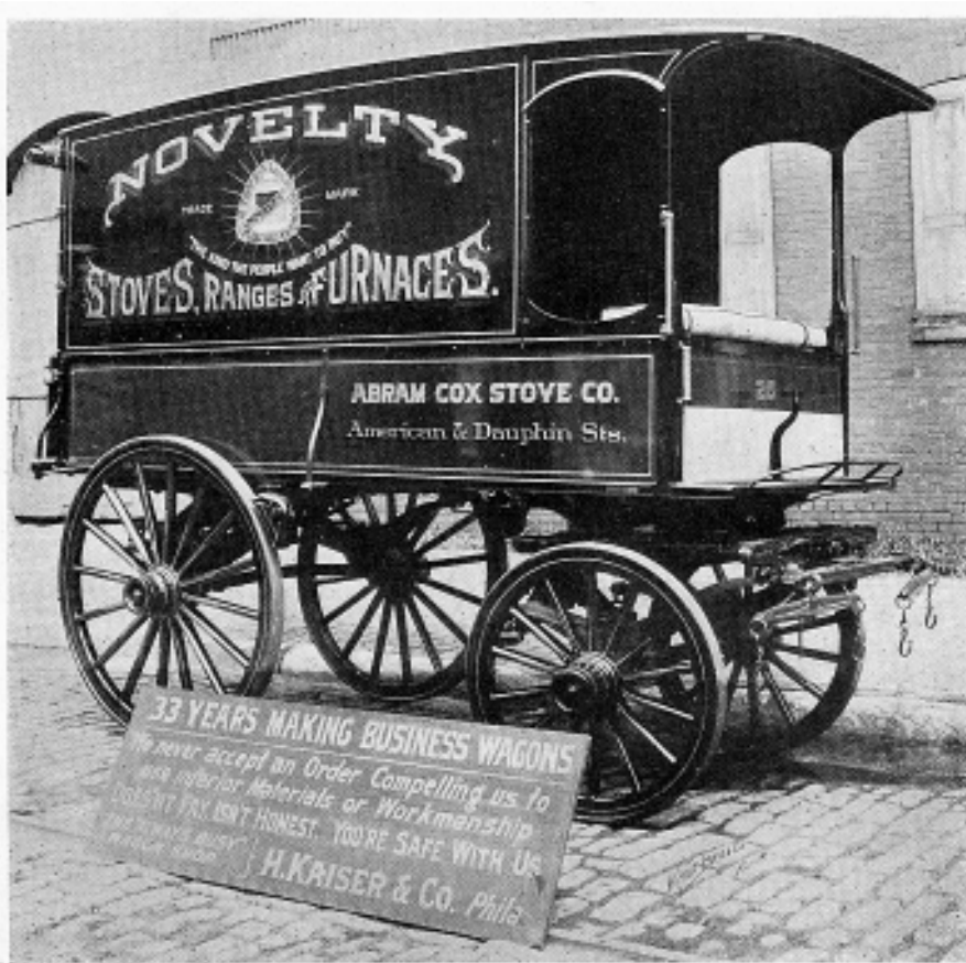
Plate No. 1506. HEAVY DELIVERY WAGON.

Built by H. Kaiser & Co., Philadelphia, Pennsylvania.