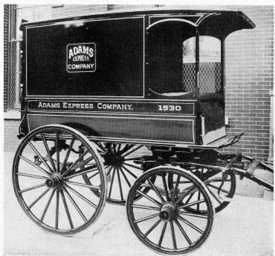
PLATE No. 1507. DELIVERY WAGON, WITH SOLID RUBBER TIRES. BUILT BY H. KAISER & CO., PHILADELPHIA, PA.

Plate No. 1507. DELIVERY WAGON, WITH SOLID RUBBER TIRES. Built by H. Kaiser & Co., Philadelphia, Pennsylvania. Carriage Monthly June 1912.