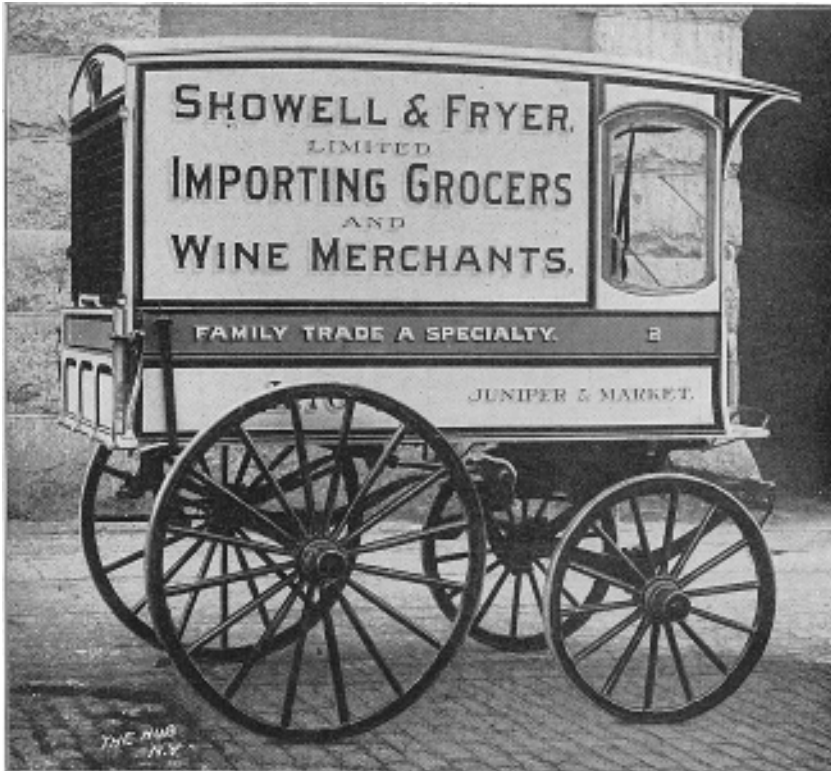
Plate CCLXVIII. GROCER'S WAGON. Built by H. Kaiser & Company, Philadelphia, Pennsylvania Hub October 1902. Also published in Hitch Wagons for City Driving and More by the Carriage Museum of America.