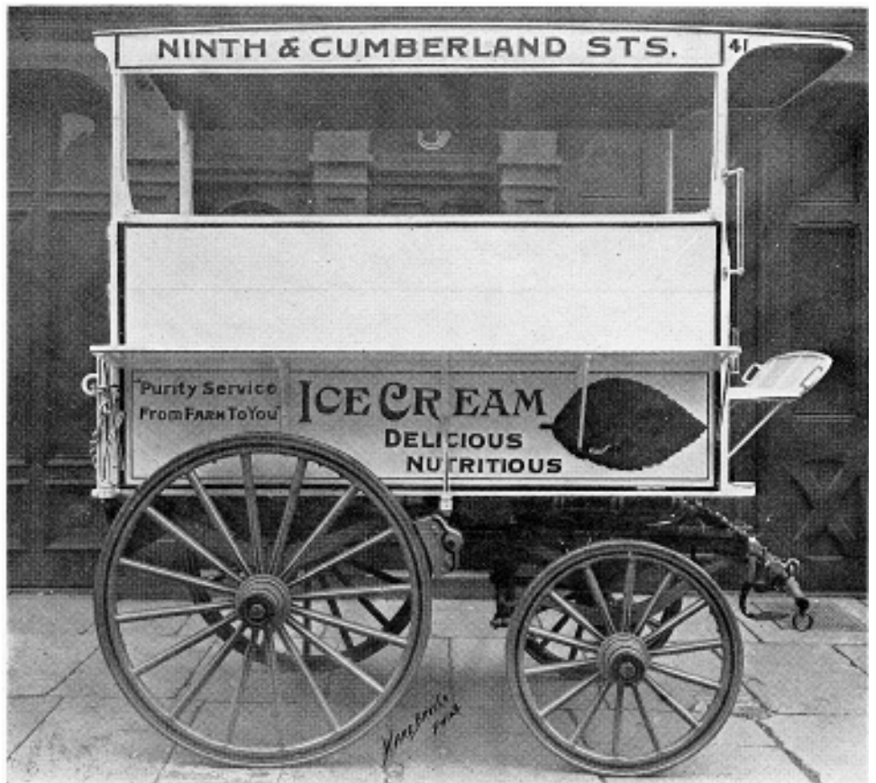
PLATE No. 1484. ICE CREAM DELIVERY WAGON.