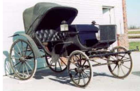
Victoria made by W. D. Rogers, Philadelphia, PA. circa 1880. with Horstmann coach lace