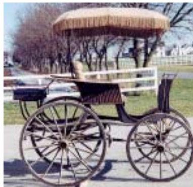
Ladies Wicker Basket Phaeton. circa 1900.