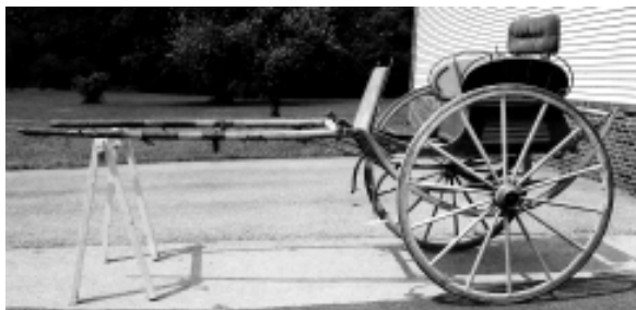
Gig on leather made by Chauncey Thomas & Company, Boston. Special patented suspension system