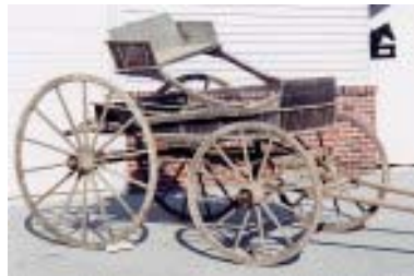
Pleasure Wagon circa 1840