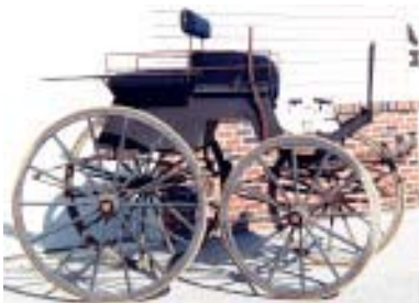
Dos-A-Dos Phaeton serial # 22525.--1900