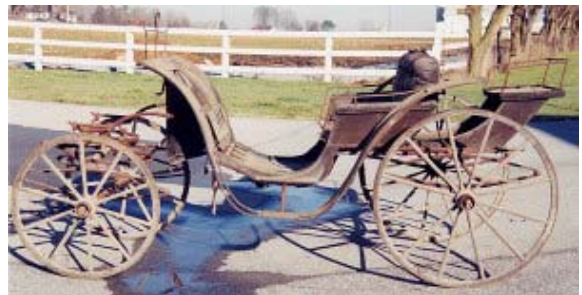
George IV Phaeton no top made by Sargeant & Ham. circa 1875.