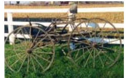
Early Concord Road wagon. circa 1855.