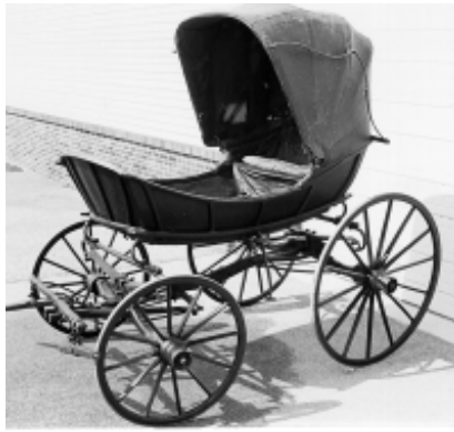
Pleasure Wagon of Gov. Dix. circa 1828.