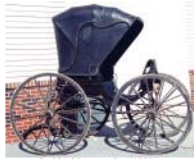
Goddard Buggy. circa 1885.