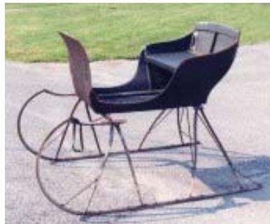
Racing cutter made by Kimball Brothers, Boston, MA. circa 1890.