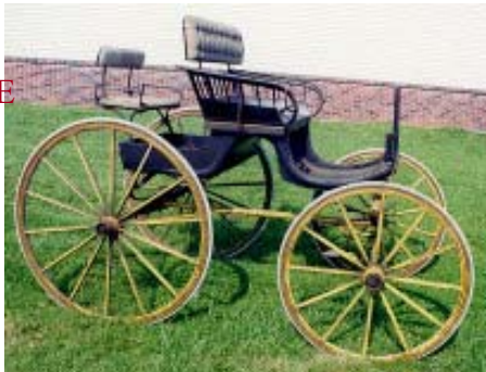
Spider Phaeton, with Rumble Seat. circa 1890.