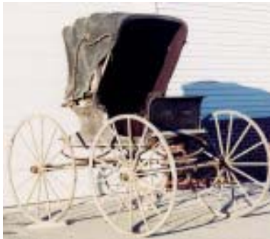
Early Coal Box Buggy, 5 bow top. circa 1855.