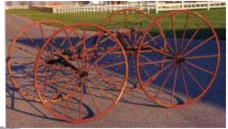
Four Wheeled Racing Sulky. circa 1860.