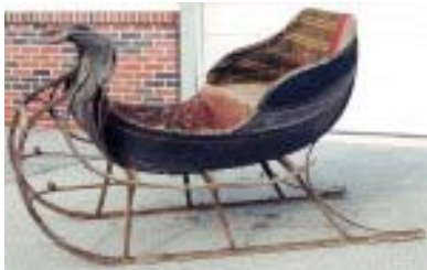
Albany cutter, circa 1860.