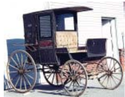
Station Rockaway, tail gate, beige whipcord upholstery. circa 1890.