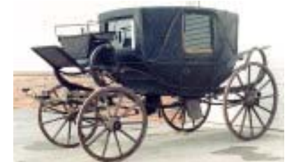
C-Spring Landau circa 1880.