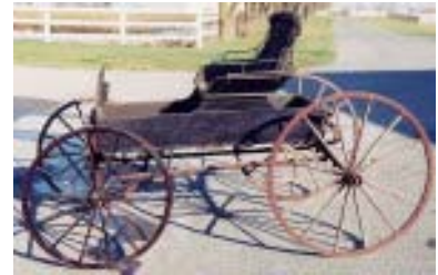
Pony Piano Box Runabout. circa 1895.