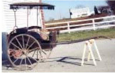
Standing top Village Cart made by Wm. P. Sargent Company. circa 1895.