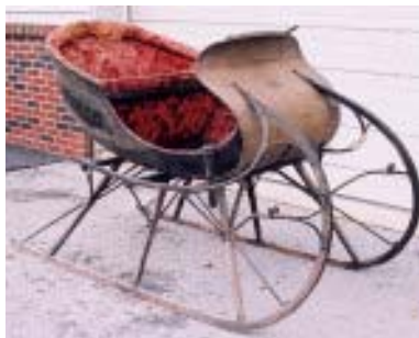
Albany sleigh with figured plush upholstery. circa 1890.