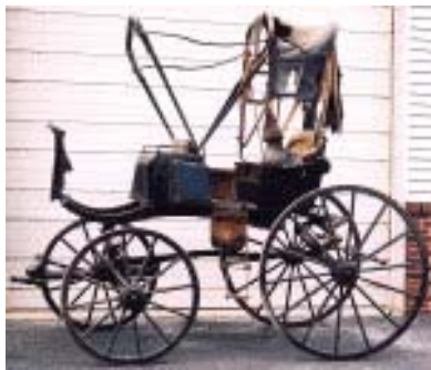
Chariotee circa 1845