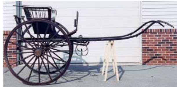
Tilbury Gig made by Brewster and Baldwin.