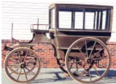
Opera bus made by Brewster & Company, serial # 24297.--1903.