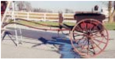
Dos-A-Dos Gig. circa 1895.