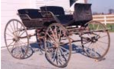
Park Phaeton circa 1870.