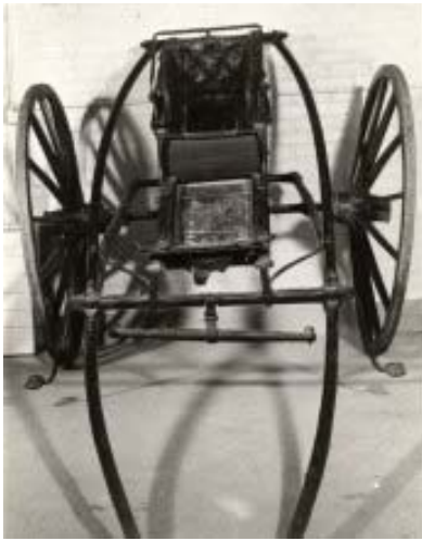
Moss Riding Chair circa 1779