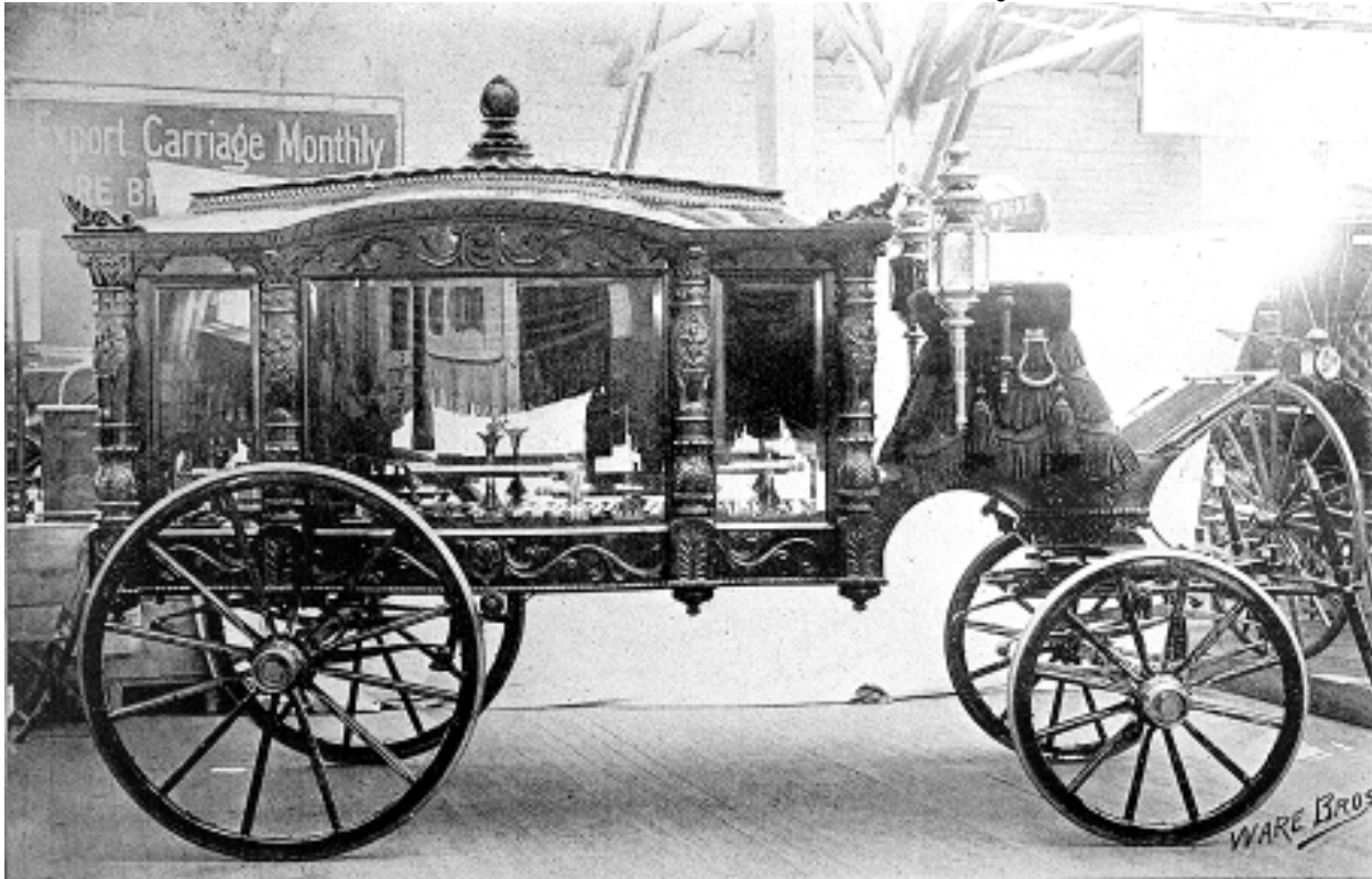
Plate No. 208. FUNERAL CAR.